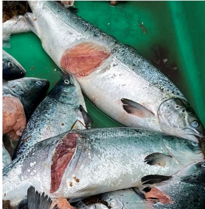
Slash / bite wounds to the flanks