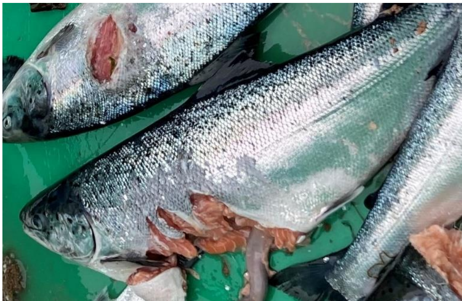
Typical slash / bite wounds targeting the liver, with evisceration