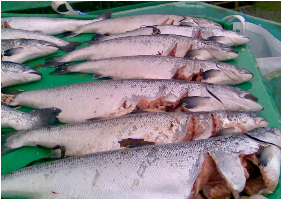
Typical slash / bite wounds targeting the liver

Here we provide some images illustrating the wounds typically experienced by a seal attack: