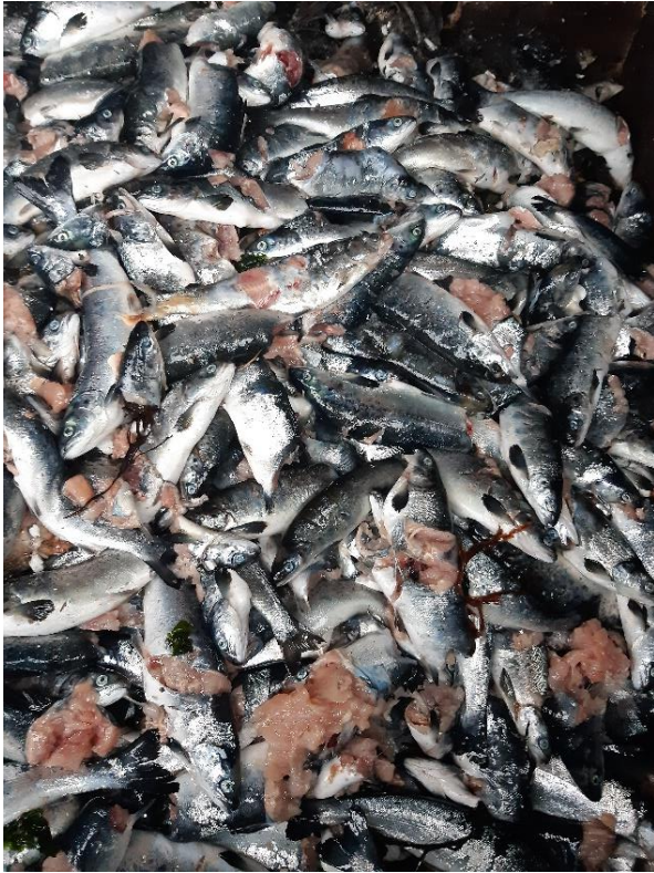
Images demonstrating the daily removal of fish killed by seals