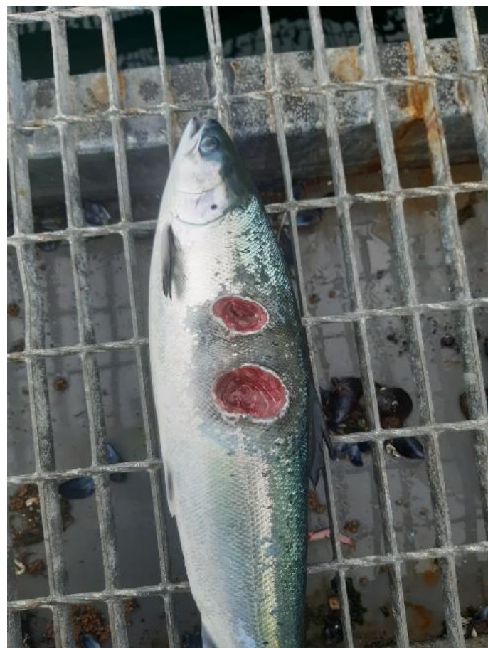
Bite wounds to the flanks (with descaling)